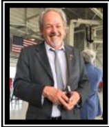
K55 Return Ceremony

Not all letters accomplish what we hope. Others do, but we can't be certain. In 2016, I was part of a team that met with the DPRK's vice foreign minister in Pyongyang. In our meeting, we requested that North Korea return more U.S. remains. They were okay with that but wanted something in return: a letter from the then President of the U.S. acknowledging that returning remains was a humanitarian gesture. Unfortunately, the then President declined, citing the DPRK's lack of cooperation in other areas. North Korea was willing to do what my President would not do. It was heartbreaking.